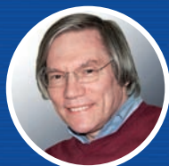
ALAN H. GUTH

Massachusetts Institute of Technology, USA