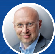
STEFAN W. HELL

Max Planck Institute for Biophysical Chemistry, Germany