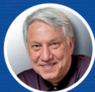
ANDREI D. LINDE

Massachusetts Institute of Technology, USA