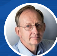
SIR JOHN B. PENDRY

Max Planck Institute for Biophysical Chemistry, Germany