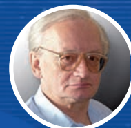
ALEXEI A. STAROBINSKY